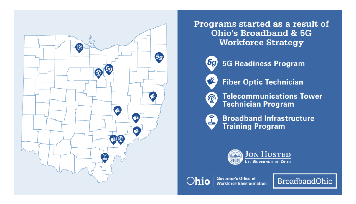
Exhibit 2: Current Program Map with the 11 training programs throughout the state

In addition, the "Broadband and 5G Connectivity Center" ("Connectivity Center") has been established and housed at The Ohio State University, to execute the statewide strategy set by the Sector Partnership. <sup>59</sup> This is where secondary and postsecondary education stakeholders, in partnership with industry, is mapping out the process to create a seamless ecosystem of curriculum and training programs geared for careers in the broadband and 5G industry that are implemented strategically at the smaller nodes, starting from mapping all the postsecondary programs in Ohio and identifying which could be quickly modified to integrate plug-and-play programs developed or distributed by the Connectivity Center. In the future, the Connectivity Center will